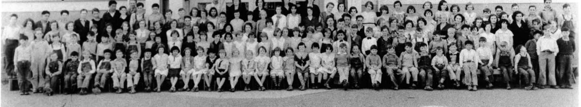
Keizer Heritage Museum

Keizer School District #88 consolidated with Salem School District 24JC on July 1, 1955.